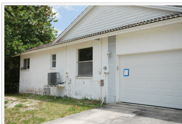
A home that has a code violation sticker attached.